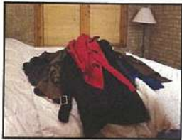
Scarf Tragically Lost In 15-Coat Pile-up