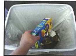
Box With Cooking Instructions Immediately Retrieved From Trash