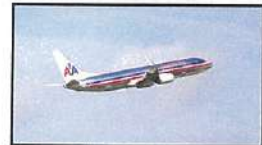
American Airlines To Phase Out Complimentary Cabin Pressurization