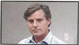
Area Man Accepts Burden Of Being Only Person On Earth Who Understands How World Actually Works